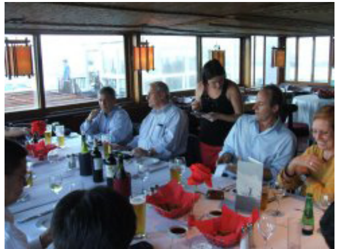
Delegates relax over supper